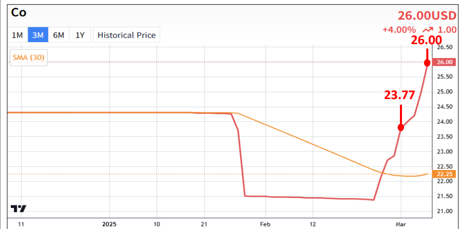
⟨Co price graph, 3 months⟩