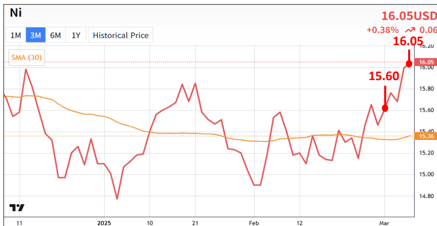
⟨Ni price graph, 3 months⟩