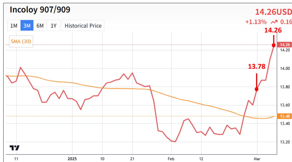
⟨Incoloy 907/909 price graph, 3 months⟩