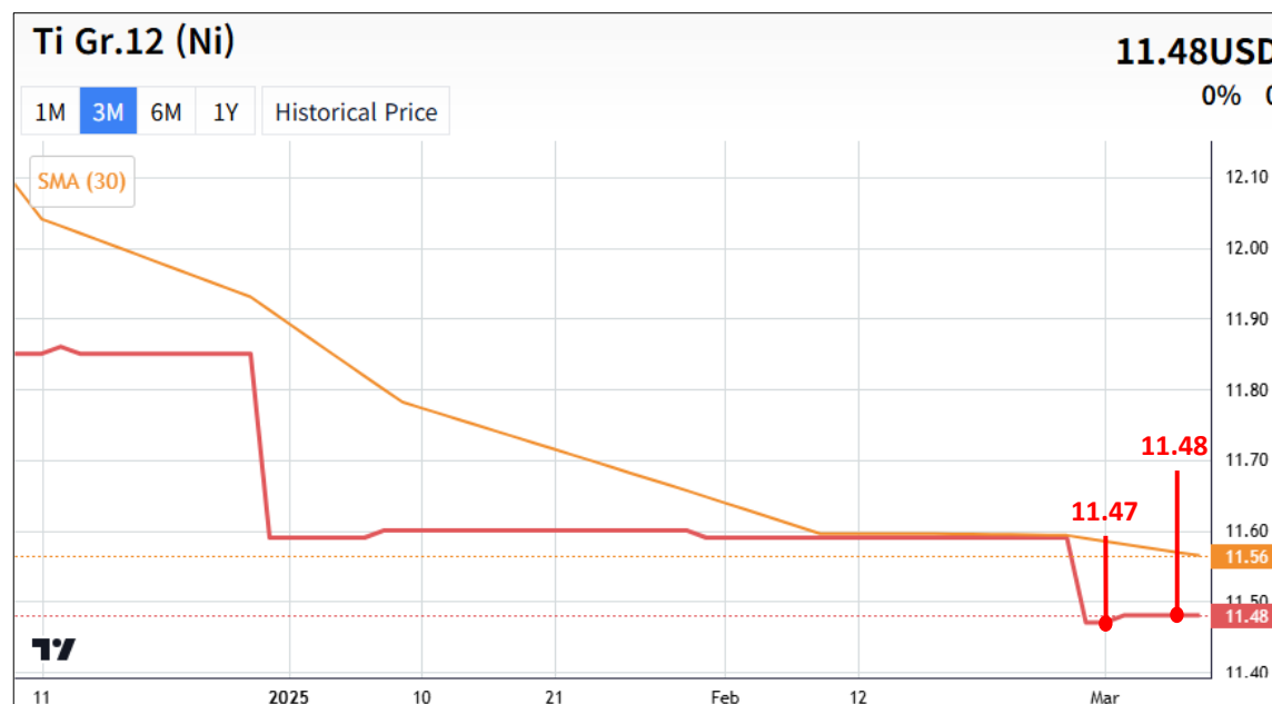
〈Ti Gr.12 price graph, 3 months〉