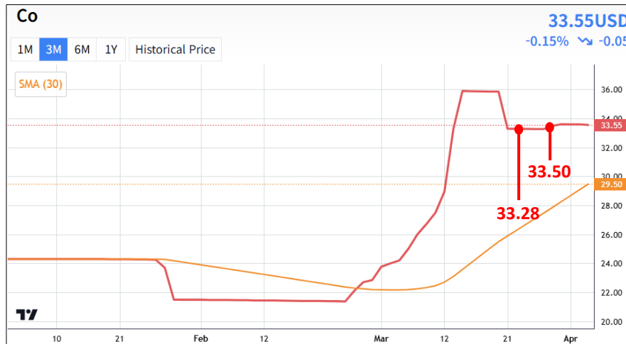
(Co price graph, 3 months)