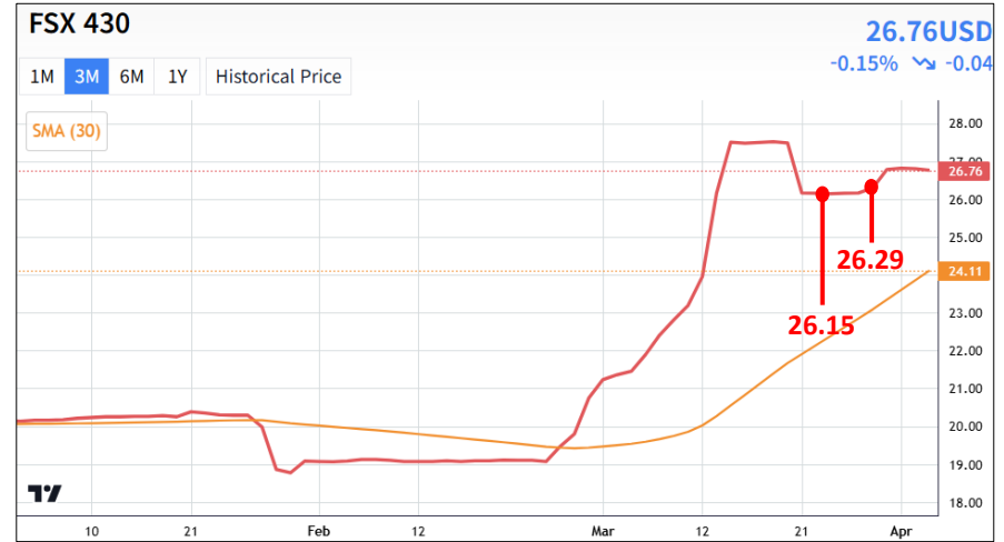
(FSX 430 price graph, 3 months)